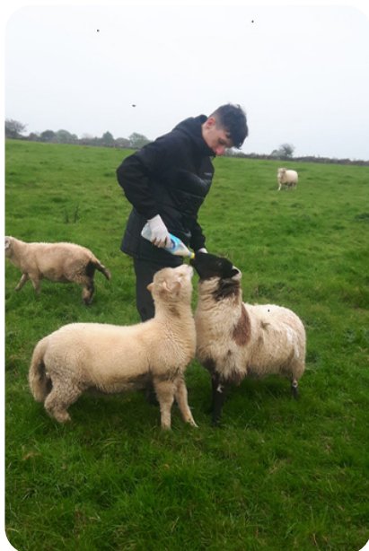
Participant from Claregalway Secondary School on Murphys Farm