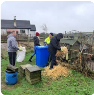
North Connaught Youth & Community Services and HSE Kildare West Wicklow MHS are among the 13 services sending participants to farms.