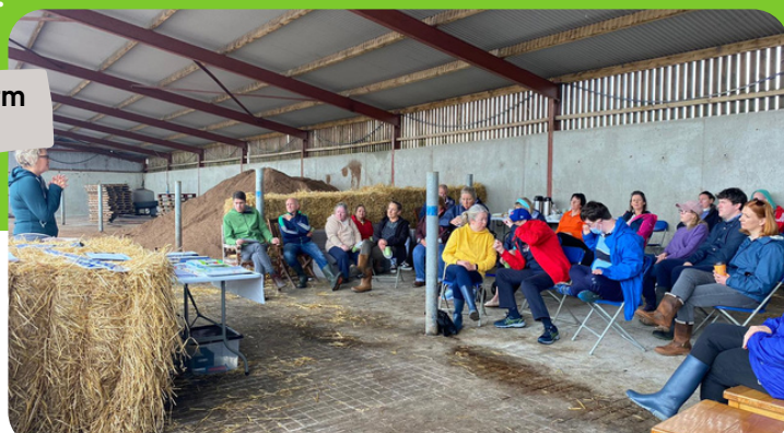
Batemans Farm Cork