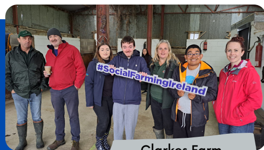
Clarke's Farm Meath

Social Farming Ireland was delighted to have participated in the all Ireland Social Farming Awareness Week from the 3rd to the 7th October. During this week 5 Farms hosted exciting open days on their farms: