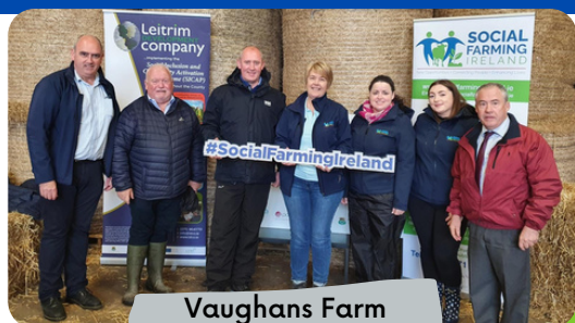
Vaughans Farm Donegal