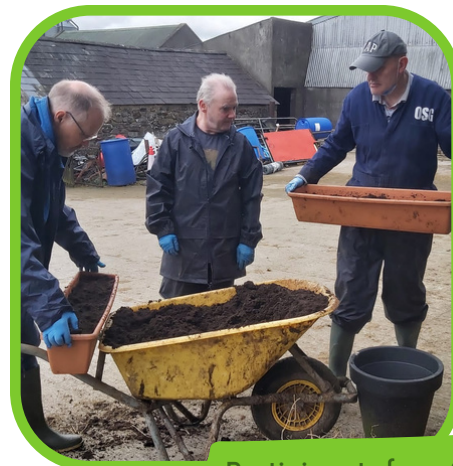
Participants from St. Christopher's Services on Whytes Farm in Longford