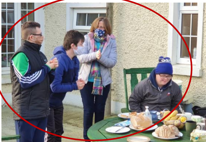
Covid Participant Bubble

Participants and farmers practice Social Farming safely during Covid restrictions